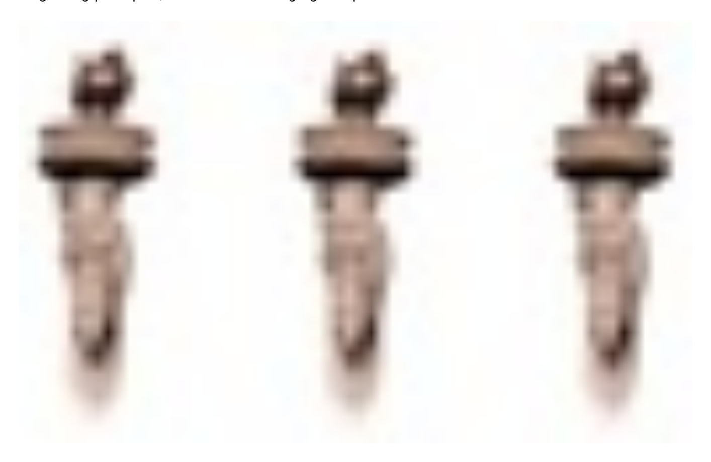
America's perpetual purpose in the world was exemplified and best articulated by America's

America does have a special role in the world—one that is morally and philosophically grounded in the principles of human liberty, and in its sense of justice. This means that the true consistency of American foreign policy is to be found not in its policies, which prudently change and adapt, but in its guiding principles, which are unchanging and permanent.